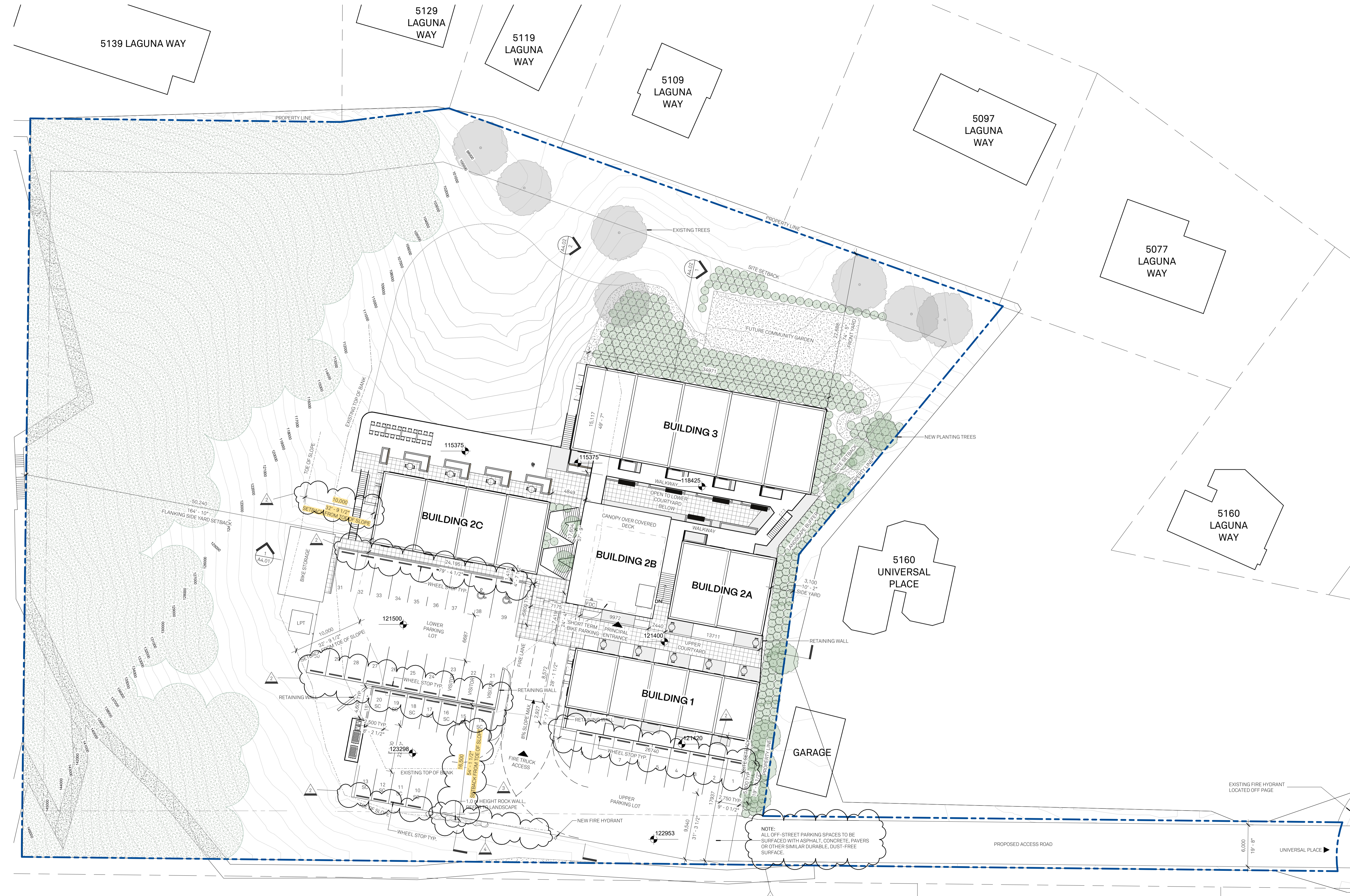
1 Site Plan - Proposed Site Plan